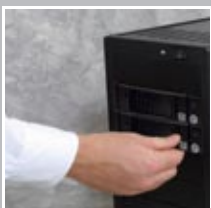
The DE100 also accomodates undersized or custom bays