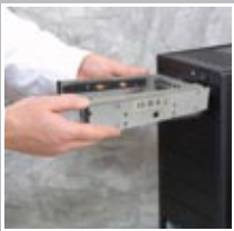
DE100 receiving frame in any standard 5.25" bay