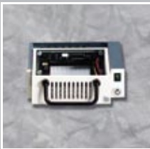
Available in Beige and Black